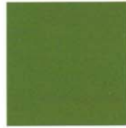
EX-239 EXPRESSION GREEN