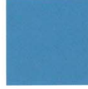
US-353 SPACE BLUE