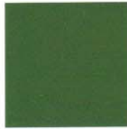
US-344 FOREST GREEN