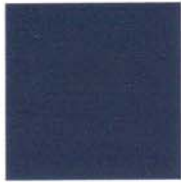
US-345 REGIMENTAL BLUE