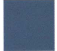
US-427 BLUE RIDGE