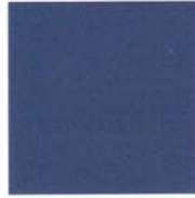
US-354 ROYAL BLUE