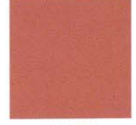
US-416 TEA ROSE